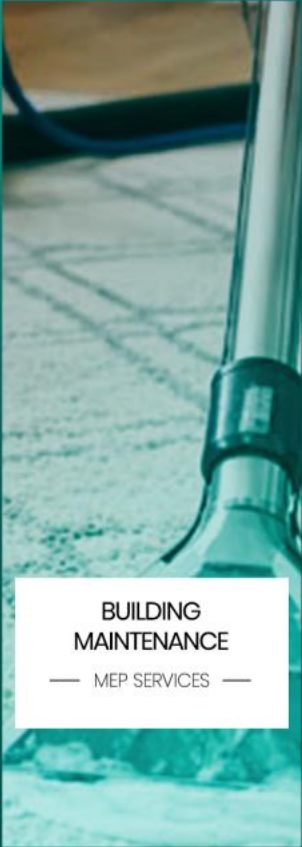
BUILDING MAINTENANCE — MEP SERVICES —