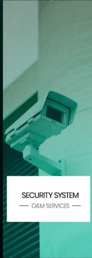
SECURITY SYSTEM — O&M SERVICES —