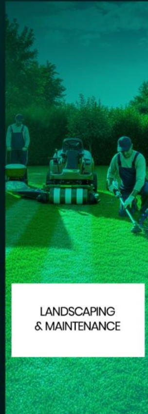
LANDSCAPING & MAINTENANCE