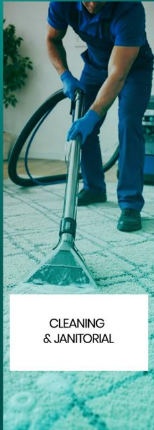
CLEANING & JANITORIAL