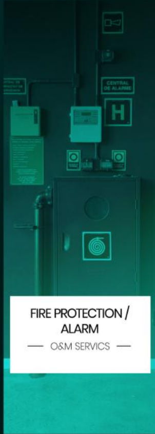
FIRE PROTECTION / ALARM — O&M SERVICES —