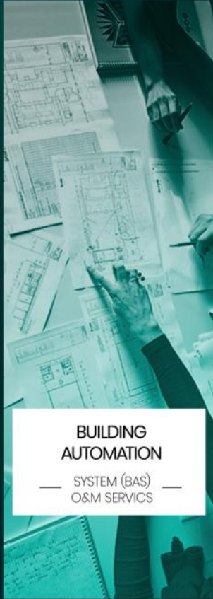
BUILDING AUTOMATION — SYSTEM (BAS) O&M SERVICES —