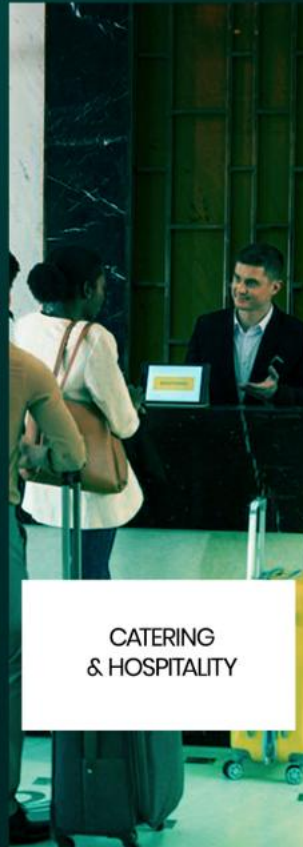
CATERING & HOSPITALITY