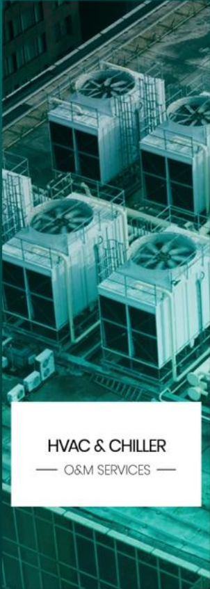
HVAC & CHILLER — O&M SERVICES —