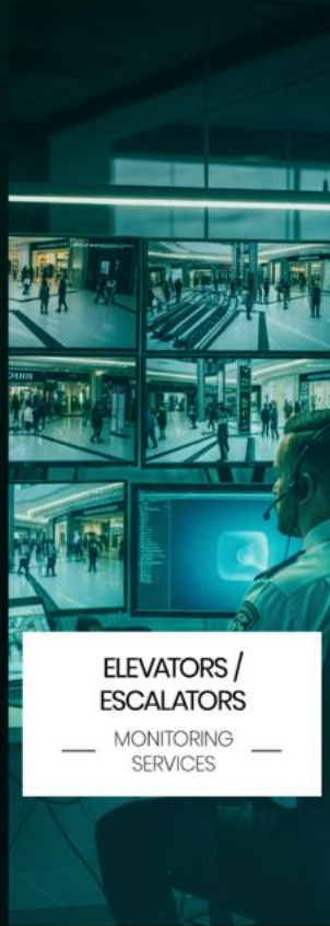
ELEVATORS / ESCALATORS — MONITORING SERVICES —